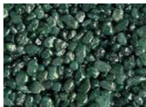
S 6028 2-3