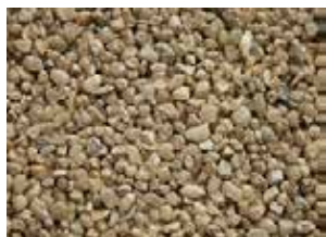
S 1004 2-3