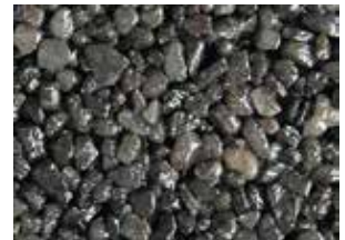
S 7028 2-3