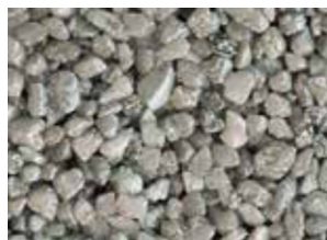
S 7124 3-4