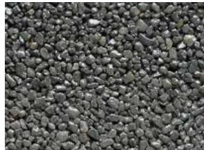
S 7024 2-3