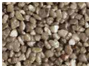
S 9202 2-3