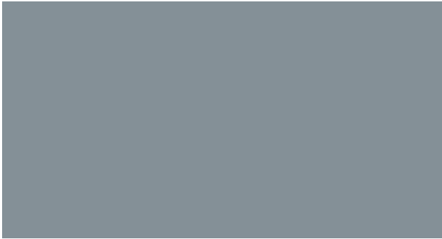
Silver Gray RAL-7001