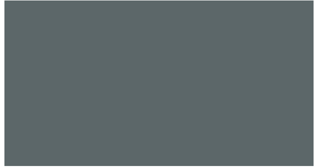
Blue Gray RAL-7031