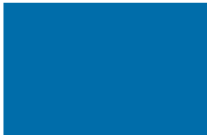
Regal Blue* RAL 5015