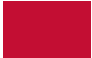
Rotunda Red RAL 3028